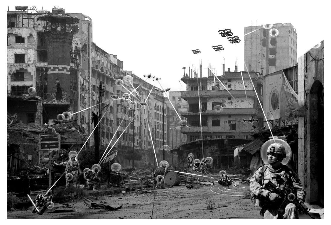
Figure 2. An intelligent cyber agent will operate in extremely complex, challenging environment: unstructured, unstable, rapidly changing, chaotic, adversarial and deceptive.

Clearly, it is beyond the current state of AI to operate intelligently in such an environmentphysical or cyber-and with such demands. While the use of AI for battlefield tasks has been explored on multiple occasions, e.g., (Rasch et al., 2002), and AI makes things individually and collectively more intelligent, it also makes the battlefield more difficult to understand and manage. Agents and Soldiers have to face a much more complex, and unpredictable world where intelligent agents have a mind of their own and perform actions that may appear inexplicable to the humans. Direct control of such intelligent agents by humans becomes impossible or limited to cases of whether to take specific destructive action.